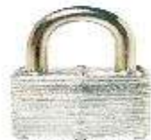
Backup and Protect

Backup and protect your files and documents against viruses, disk crashes, data corruption and data theft. Store your sensitive and confidential files without hesitation - 128-bit SSL encryption is on guard.