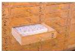
Store and Manage

Organize your information in the way you like it. Use folder hierarchy, special notification process, and integrated search option.