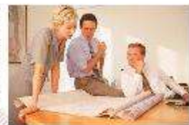
Share and Collaborate

Securely share your documents, files and folders in the Internet. Collaborate with co-workers, remote workers, business partners and friends.